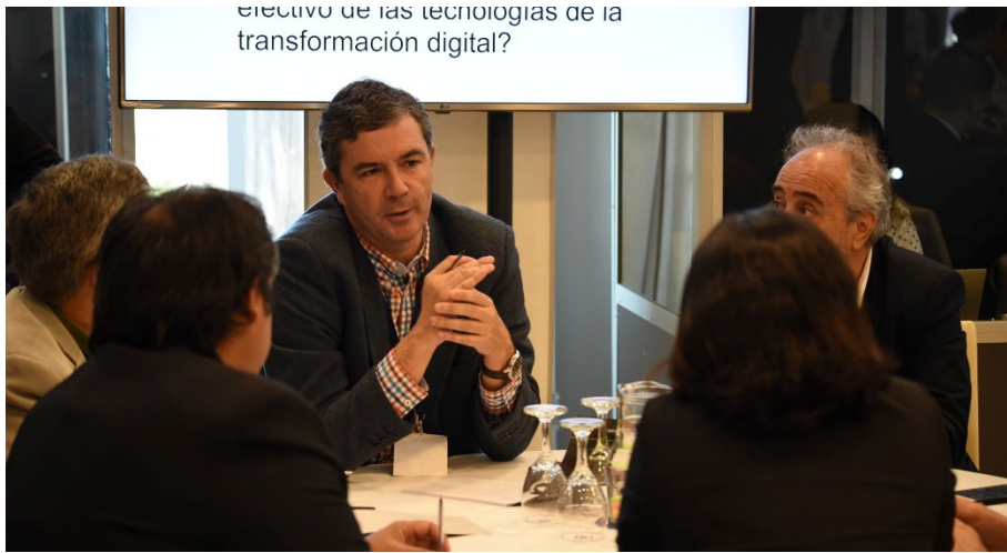
Fig. 1: Dialogue held in Montevideo on 16 November 2022 using the World Café methodology.